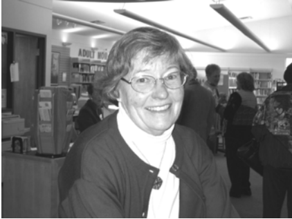
New Wiaraton Branch