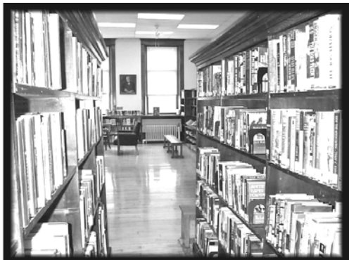
Trillium Grant for flooring, Port Elgin