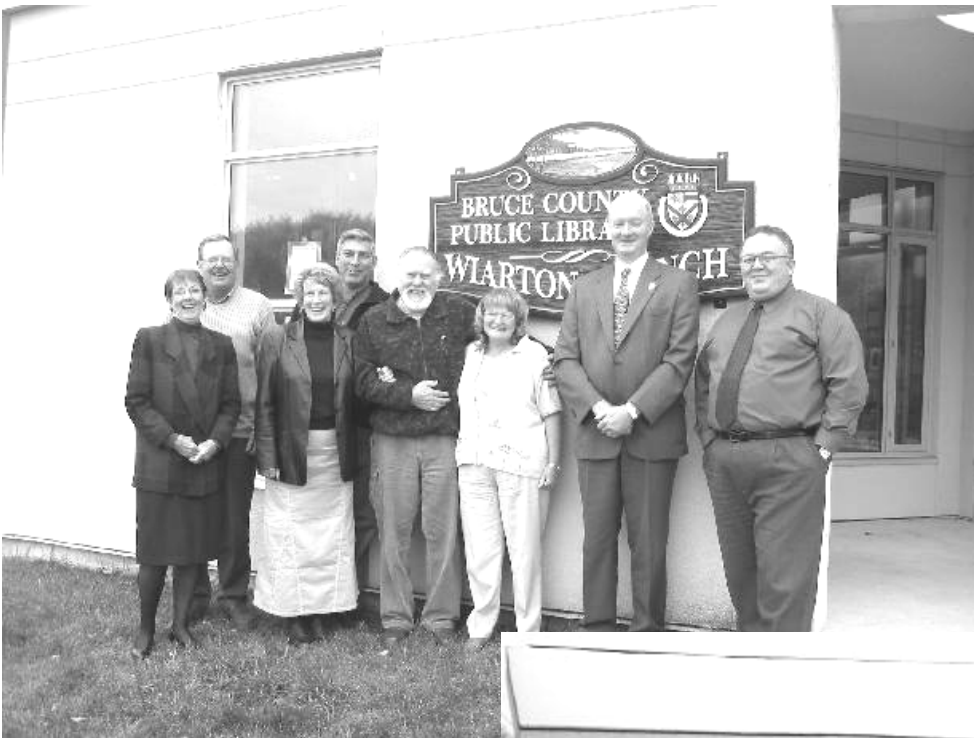
New standard signs