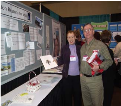
River John, Nova Scotia