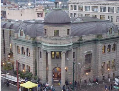
The Carnegie Library

◀ The Friends of the Vancouver Public Library in British Columbia sponsored aboriginal writers' workshops to enable them to share their stories at several library branches. The readings gave local and other residents the opportunity to see, hear, and meet established aboriginal writers from various parts of the country, writing in a variety of genres. At the workshops, established writers acted as mentors, inspiration, and guides to many local writers.