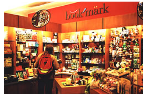
book'mark Library Store

Friends of the London Public Library, Ontario