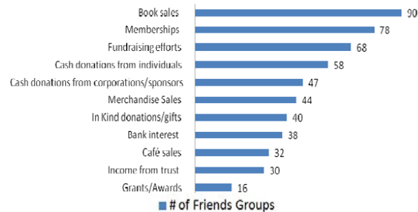
* Counting Opinions survey of 121 Friends groups across Canada, 2010