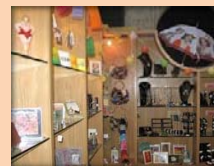
Customers will find an intriguing array of merchandise with a connection to books, writers and readers with something special for every age group.