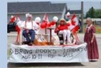
Friends float promotes summer booksale in Sunderland, Ontario