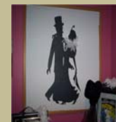
Putting On The Ritz Silent Auction Fundraiser in North Perth