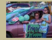
Friends of the Library in Community Parade, Smithers, British Columbia