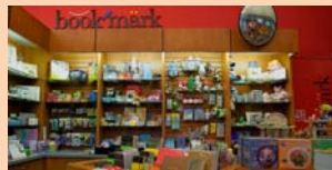
Friends of the Vancouver Public Library run a gift shop