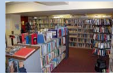
Friends of the Ottawa Public Library Association operate bookstores, sell semi-ongoing book sales and specialty book sales in 12 branches. In this bookstore at the Main Branch, they raise $96,000 a year.