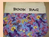
Book Bags sold by the Friends of the Lindsay Branch of the Kawartha Lakes Public Library