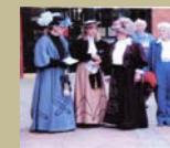
Celebrating 100 years of library history in Lindsay, Ontario